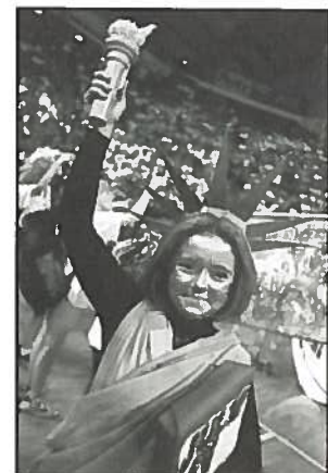
New Jersey's Entry

North Dakota Curacao Nevada New Jersey Washington Louisiana Maryland