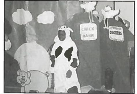
Hopkins Elementary School's Heroic Proportions Team.