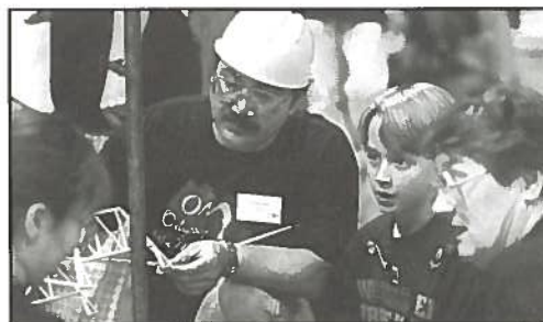
An OM official inspects a structure.

Exceptional creativity was shown in the team's portrayal of the effects of "dancing fire" and "billowing smoke." Together with the makeup, costumes and actions, the team's unique presentation brought the "Chicago Fire" to life.