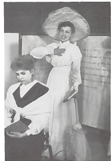
Team members impress world finals judges.