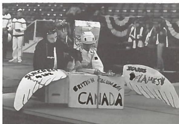
Membership signs come in all shapes and sizes.

Coaching an OM team is unlike coaching any other sport because the coach is NOT the Leader, NOT the Problem Solver, NOT the Decision Maker. NOT being any of those is VERY HARD WORK.— Taken from California's state program.