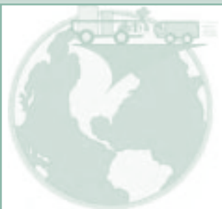
"A Scene From Above"

"We view our continued involvement as one of the best ways to reach such a vast and extremely talented audience."