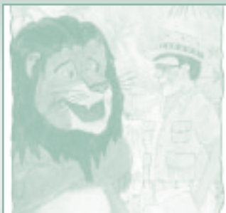
"The Jungle Bloke"