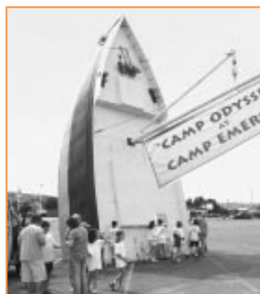
Camp Odyssey gives summer campers a taste of outdoor creative problem solving.

Camp Odyssey takes all the elements of Odyssey of the Mind and adapts them to the camp environment. Teams of seven campers are formed, based on age, with one coach per team. Each team is given a problem