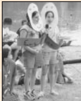
Campers in a typical Odyssey getup.

Camp Emerson representatives are available to come to your local competitions to discuss Camp Odyssey. There's also a camp video and CD ROM that includes footage from Camp Odyssey. For information, call 800-532-CAMP or e-mail sue@campemerson.com , or visit www.campemerson.com .